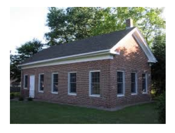
Enfield Historical Society

1294 Enfield Street (Route 5) Enfield, CT USA